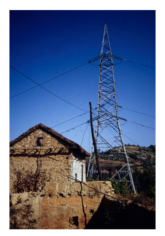
Figure 1: National Grid pylon and transmission lines which do not serve the local village where it is situated, on the Pokhara road, Nepal.

The grid can be owned privately or by the state and is not necessarily owned by the electricity